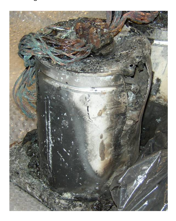
Fig. 4: Burst pressure vessel of a line filter capacitor

Several areas of damage were caused by parallel resonant circuits existing of capacitors (reactive power compensation or line filters) and inductances (generator, turbine transformer, energy supply companies, power chokes, etc.) which had not been taken into account when designing the turbine. The resonant circuits were activated by harmonics. Resonance phenomena generated high currents which damaged capacitors. Breakdowns in the dielectric of the already damaged capacitors – usually caused by overvoltage events – resulted in an increase of power loss and in some cases in the bursting of the capacitor containers. The resulting fires caused total loss to the reactive power compensation or to the inverter. Protective circuits through discharge resistors and choking were not available in these cases.