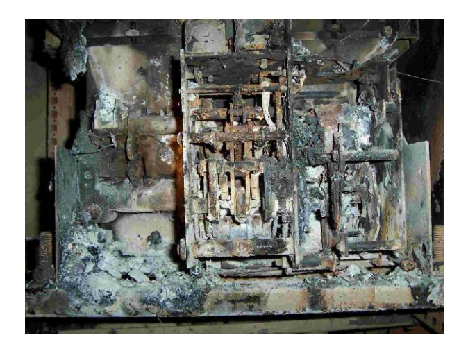
Fig. 3: Power switch of a 1 MW wind turbine – destroyed by fire

Low voltage switchgear was installed within the nacelle of a 1 MW wind turbine. The bolted connection at one of the input contacts of the low-voltage power switch was not sufficiently tightened. The high contact resistance resulted in a significant temperature increase at the junction and in the ignition of adjacent combustible material in the switchgear cabinet. The fuses situated in front did not respond until the thermal damage by the fire was very severe. Control, inverter and switchgear cabinets that were arranged next to each other suffered a total loss. The interior of the nacelle was full of soot. Despite the enormous heat in the area of the seat of fire, the fire was unable to spread across the metal nacelle casing. The damage to property amounted to EUR 500,000.