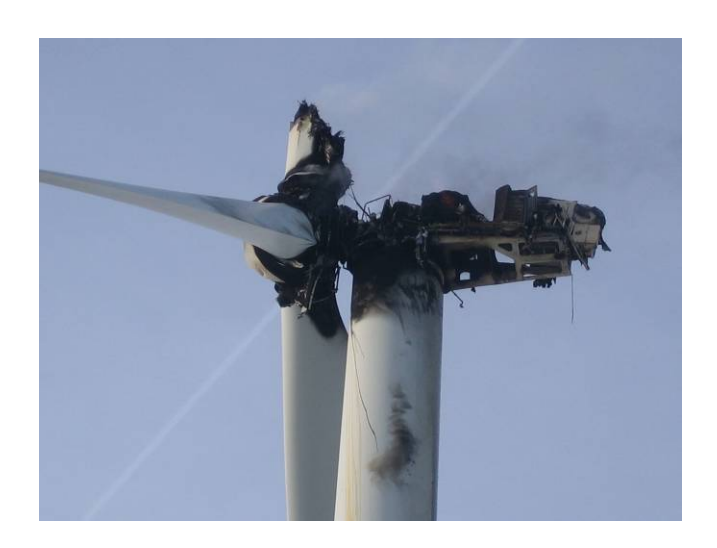
Fig. 2: Burnt down nacelle of a 1.5 MW wind turbine