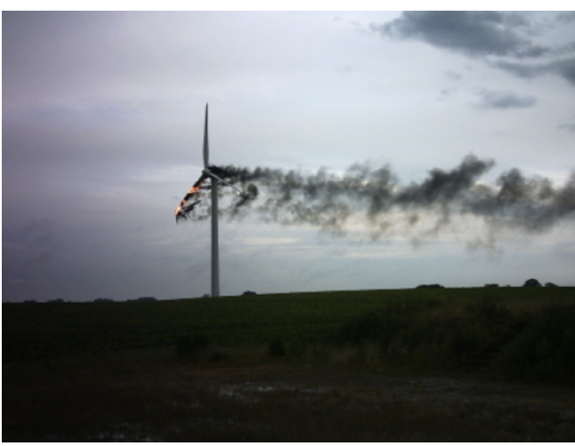
Fig. 1a+b: Fire after lightning struck a 2 MW wind turbine in 2004

The burning blade stopped at an upright position and burned off completely little by little. Burning parts of the blades that fell down caused a secondary fire in the nacelle.